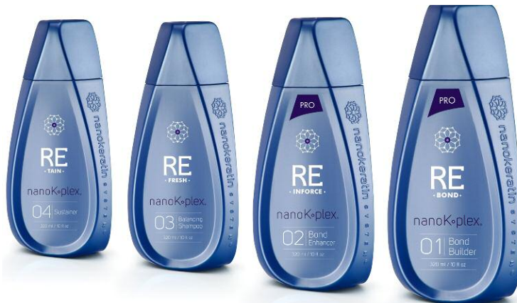
The nanoKplex Hair Bonding Series includes Rebond Bond Builder and Reinforce Bond Enhancer in-salon treatments, plus Refresh Balancing Shampoo and Retain Sustainer for home use to reinforce the treatments' results.

3. The softSmooth Series is an at-home natural soft smoother for all hair types and textures. It's based on patented SM156A Biomimetic technology for progressive hair smoothing with every use without heat. softSmooth builds the outer foundation and a solid inner layer to seal nourishing nutrients inside the hair, enabling its self recuperation. Continuous use of softSmooth enhances hair's fiber alignment and frizz control, and helps relax curly and wavy hair. The result is hair that's soft, smooth, frizz-free, healthy, elastic, shiny, silky and manageable.