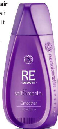
softSmooth smoothes the hair with every use for frizz control and a smooth finish.

2. The nanoKplex Hair Bonding Series takes hair bonding to a new level. It builds, multiplies, reinforces and stabilizes all hair bonds as disulfide (sulphur) and van der Waals. This advanced, 2-stage in-salon hair recuperation service and 2-stage complementary home-care system leaves even the most chemically damaged hair healthy, elastic, lustrous, silky and manageable. Based on patented M460P Biomimetic technology, nanoKplex integrates fresh milk and allows the hair to heal itself back to its natural state during and after in-salon chemical processes.