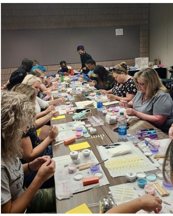
left: The Nail Tech of the Smokies VIP Gift Bag has become legendary. The 150 holders of the VIP tickets all received the bag, along with entry an hour earlier to the show. Each company's logo was featured on the show's home page with their website link embedded into each photo. right: The show featured classes and workshops covering every nail service and answering business questions.

Retreat for education and comaraderie in Pigeon Forge, TN, at the Moose Hollow Lodge. The second retreat takes place on Sunday, September 26, through Thursday, September 30, 2021. The cost is $600 per person, which covers first and last nights' dinners plus snacks; all nail classes in the conference center; an evening of shopping with the educators to stock up on supplies;